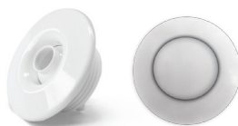
Direction adjustable jet and air push control