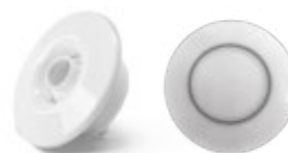
Direction adjustable jet and air push control

MAAX TIP: Adjust massage intensity by varying the air control dial.